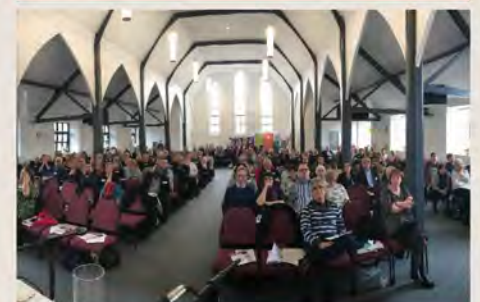
Sheffield Heeley Church – assembly crowd